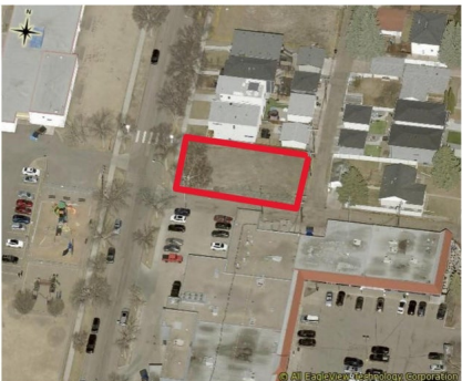
9115 143 St-Location